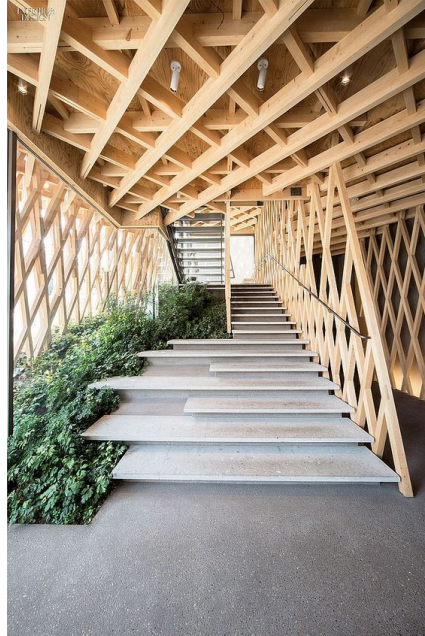
pure and structured