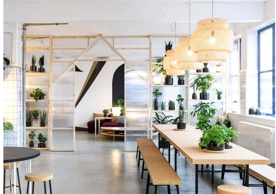
natural - wood and touches of green